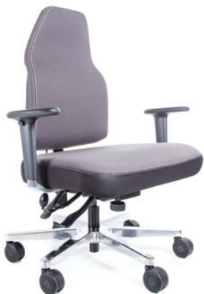
Bariatric Plush 250