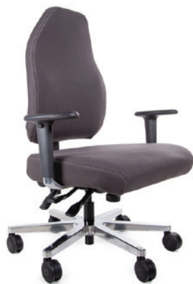
Bariatric Plush Elite 250