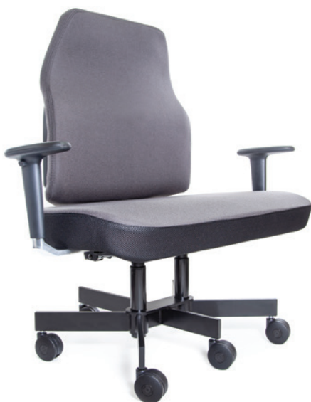
Bariatric Plush Elite 300