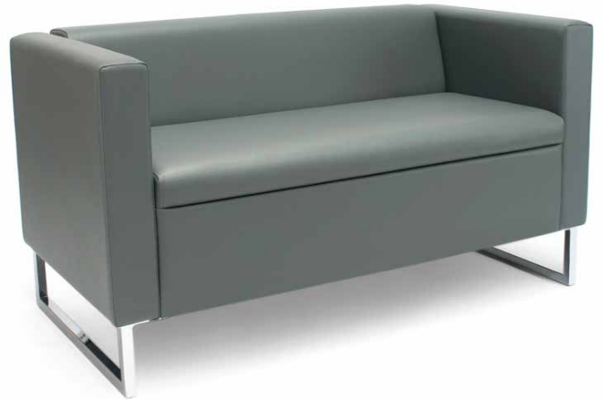
Ruby 3 Seater