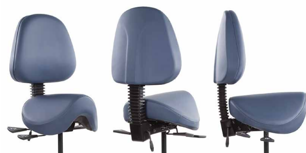
Ergo Saddle With Backrest

Designed and development in Australia, the Ergo Saddle is available in both a Standard and Slimline design and can be purchased with or without a Backrest.